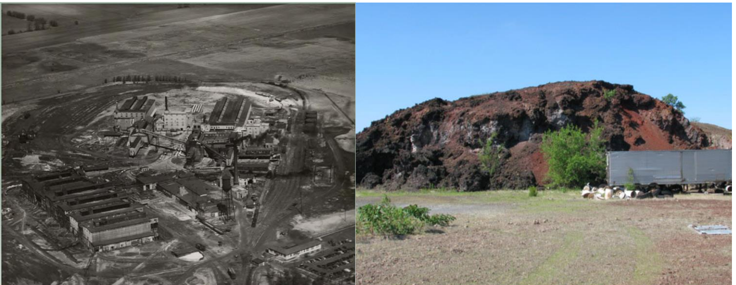
Figure 1. Photos of the Hegeler Zinc Facility in Vermilion County, IL. Left: an aerial photo of the facility in 1940 (USEPA presentation). Right: a zinc slag pile, residual waste of facility operations (picture taken by CAS staff).